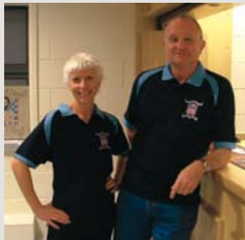
Mens and ladies bar shirt